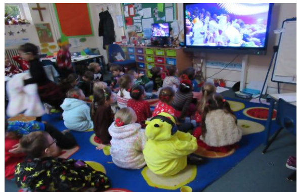
Cosy movie treat