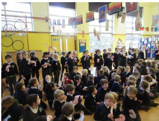
Creative Prayer morning – Candy Cane