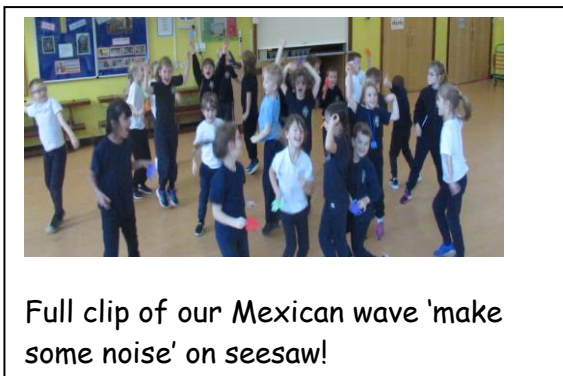
Full clip of our Mexican wave 'make some noise' on seesaw!